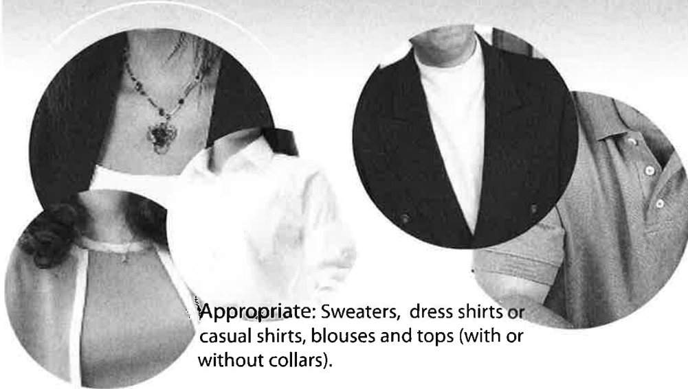
Appropriate: Sweaters, dress shirts or casual shirts, blouses and tops (with or without collars).