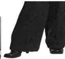
Appropriate: Dress shoes, boots, sandals, sneakers/tennis shoes (professional looking, clean and in good repair), loafers or walking shoes.