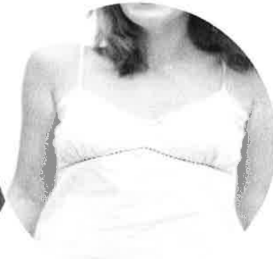
Inappropriate: Anything low-cut, revealing or see-through.