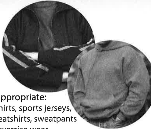
Inappropriate: T-shirts, sports jerseys, sweatshirts, sweatpants or exercise wear.