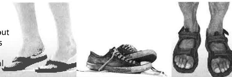
Inappropriate: Flip-flops, beach-style sandals or stained/worn-out sneakers/tennis shoes that are not professional looking.