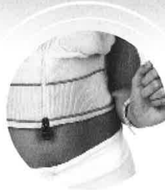
Inappropriate: Revealing clothing or styles, including exposed midsections.