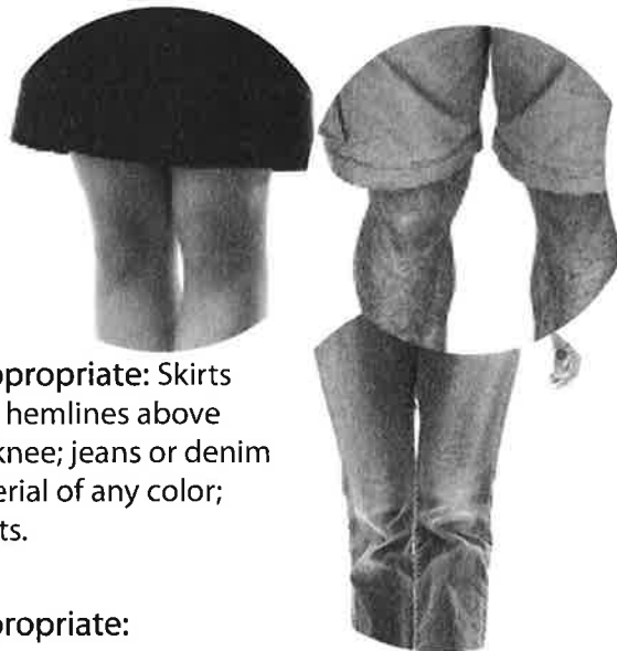
Inappropriate: Skirts with hemlines above the knee; jeans or denim material of any color; shorts.