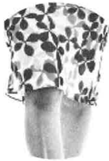
Appropriate: Skirts or dresses that are knee-length or longer; casual pants (like Dockers) and associate I.D. badge.