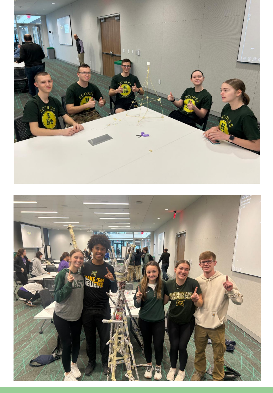
Feld Entertainment - Career Opportunities for Students / Alumni